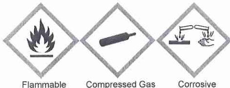
Flammable Compressed Gas Corrosive

Skin corrosion - Category 1 Eye Damage - Category 1 Flammable aerosol - Category 1 Gasses under pressure - Liquefied gas